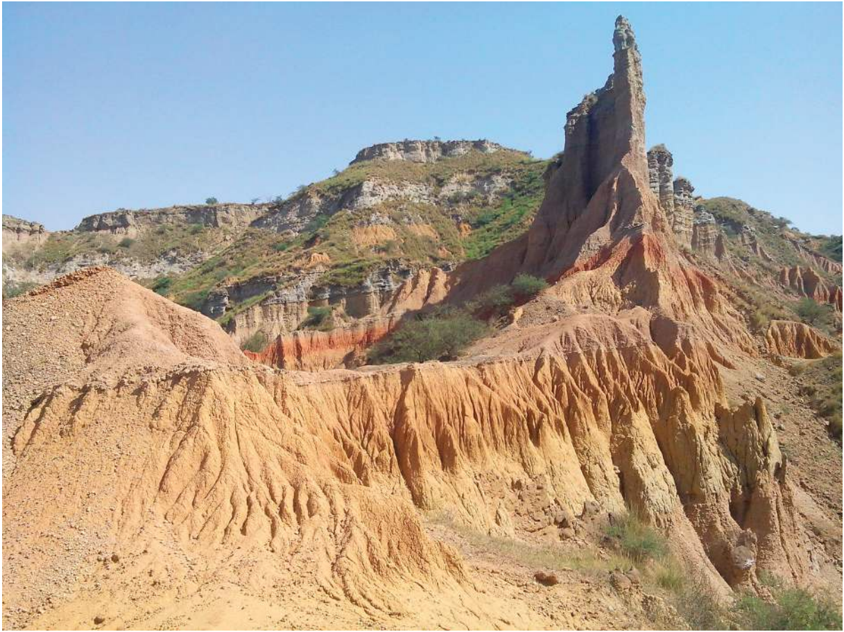
Fig. 1.2 for Question 1